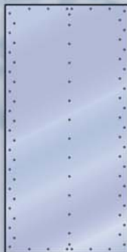
Shear Wall with Adhesive and Pins