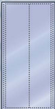
Shear Wall with Screws